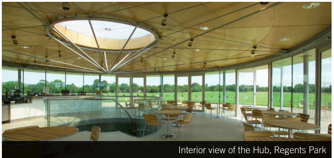
Interior view of the Hub, Regents Park