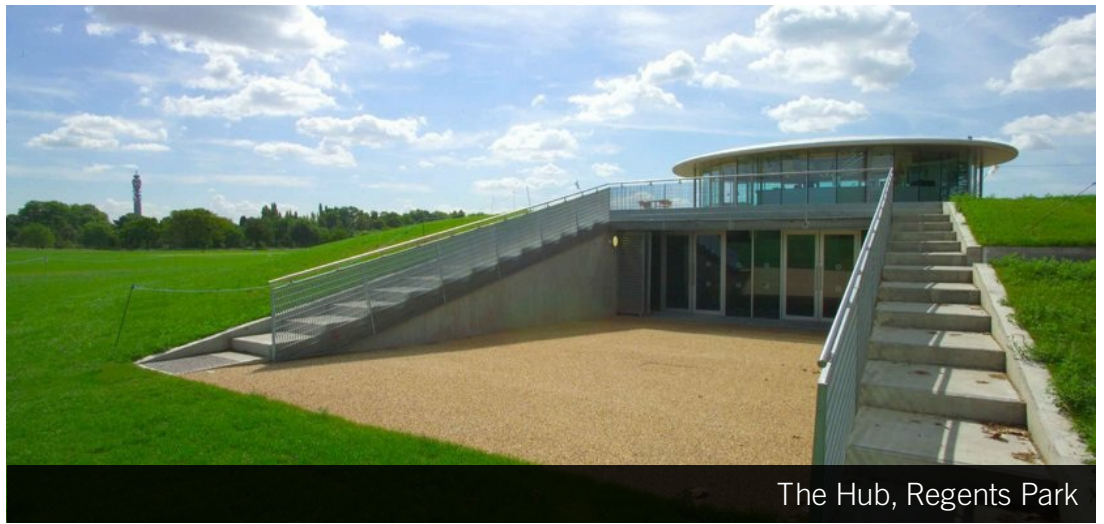
The Hub, Regents Park