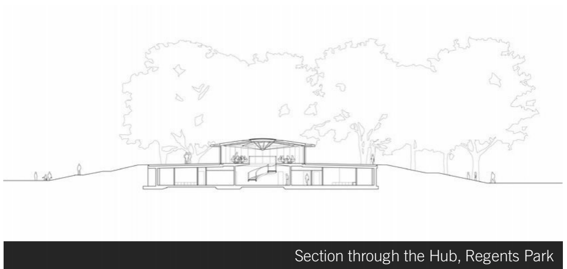
Section through the Hub, Regents Park